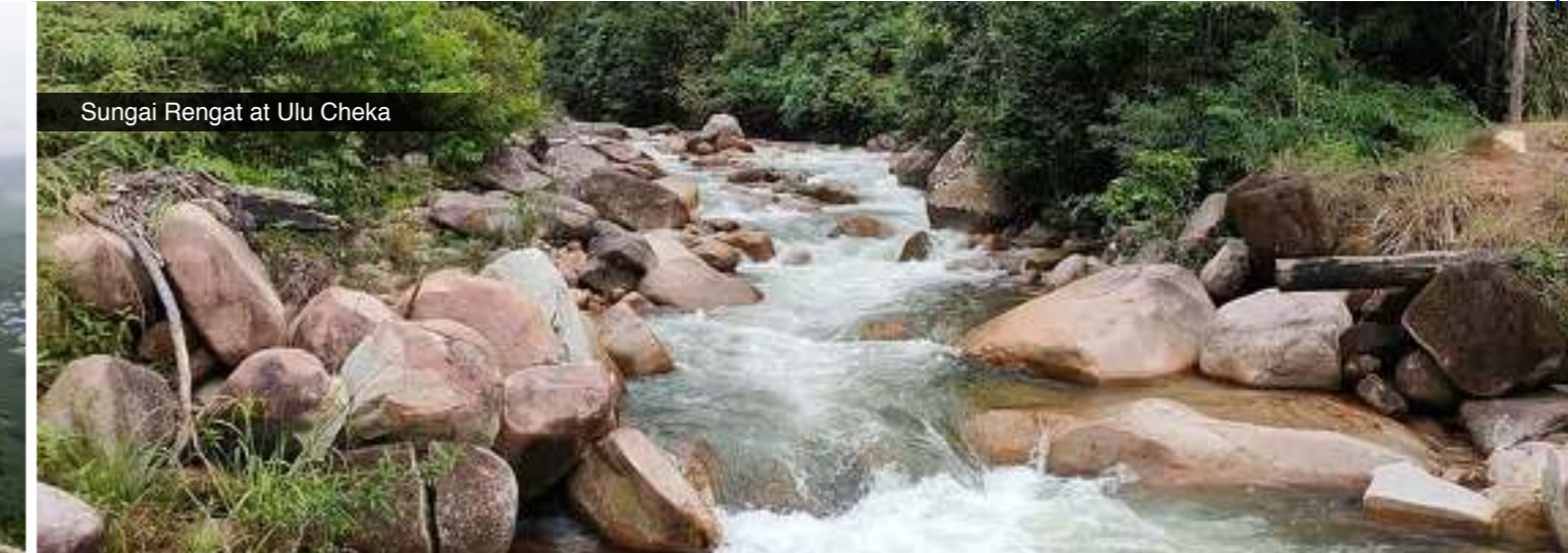
Sungai Rengat at Ulu Cheka

Jerantut also provides access to other recreational activities, including kayaking on the Pahang River near Kuala Tembeling, a village where the Tembeling and