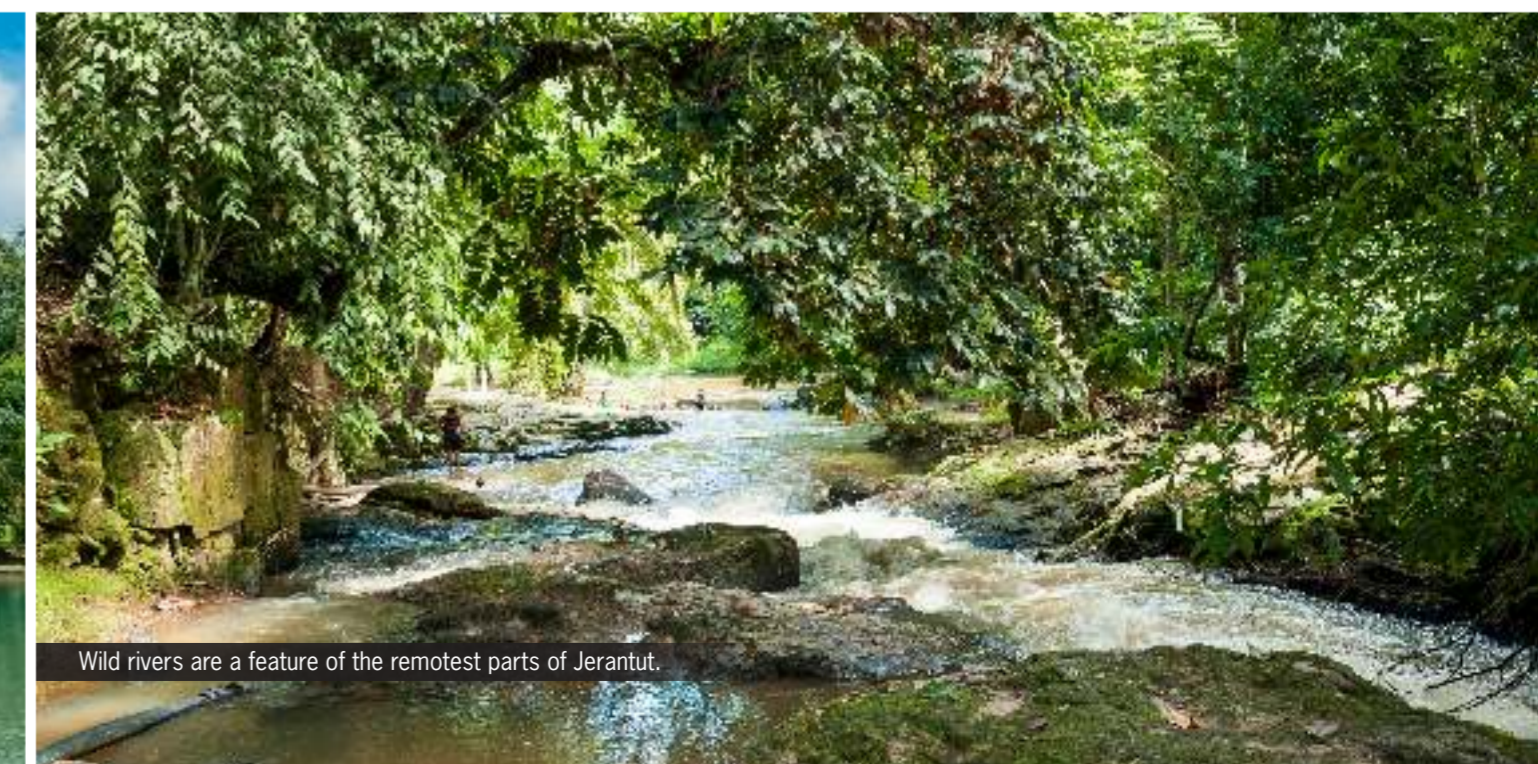
Wild rivers are a feature of the remotest parts of Jerantut.