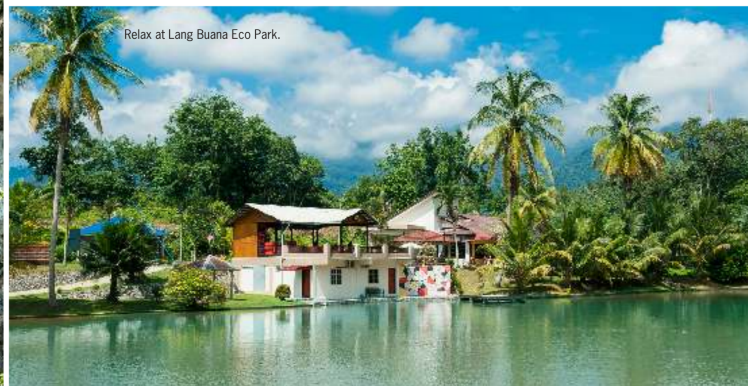
Relax at Lang Buana Eco Park.

Jerantut Railway Station, on the railway line connecting Tumpat in Kelantan to Johor Bahru, is serviced by two daily trains. It is one of the stops on the East Coast Railway, often referred to as the Jungle Railway. The train was once a popular way to access Jerantut and Taman Negara, but now road transport is more popular.