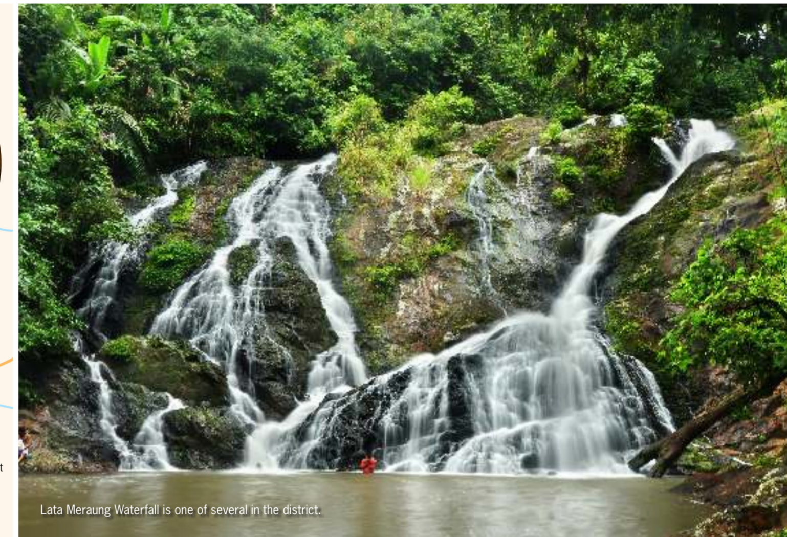
Lata Meraung Waterfall is one of several in the district.

Jelai Rivers meet. Here the rivers become the Pahang River, and it is from the nearby jetty that many tourists travel by boat to Taman Negara.