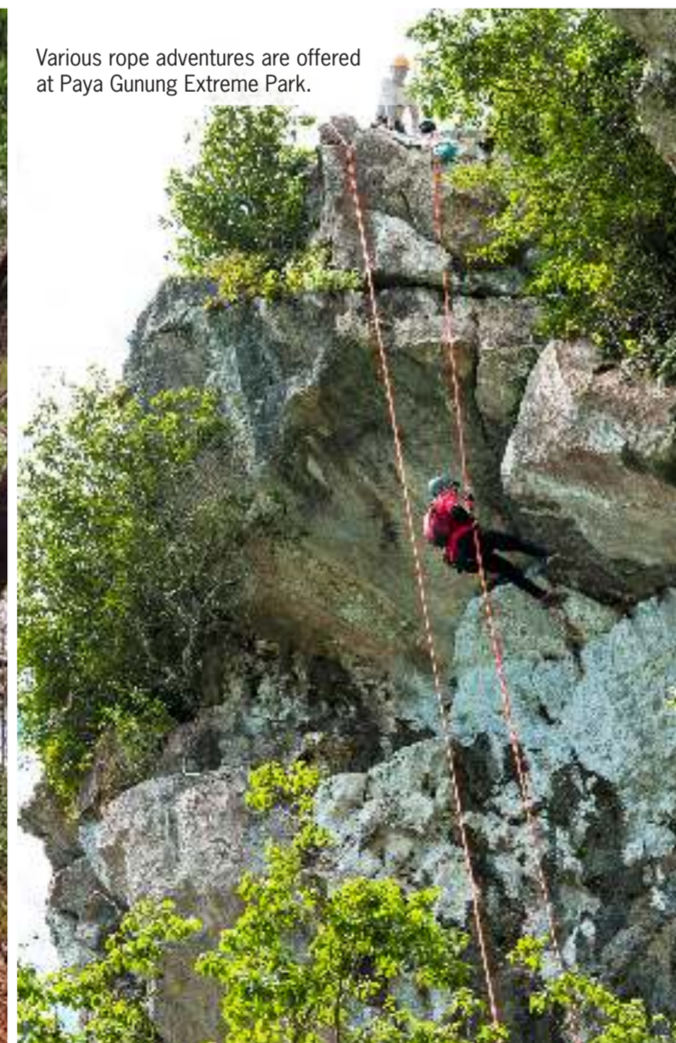
Various rope adventures are offered at Paya Gunung Extreme Park.