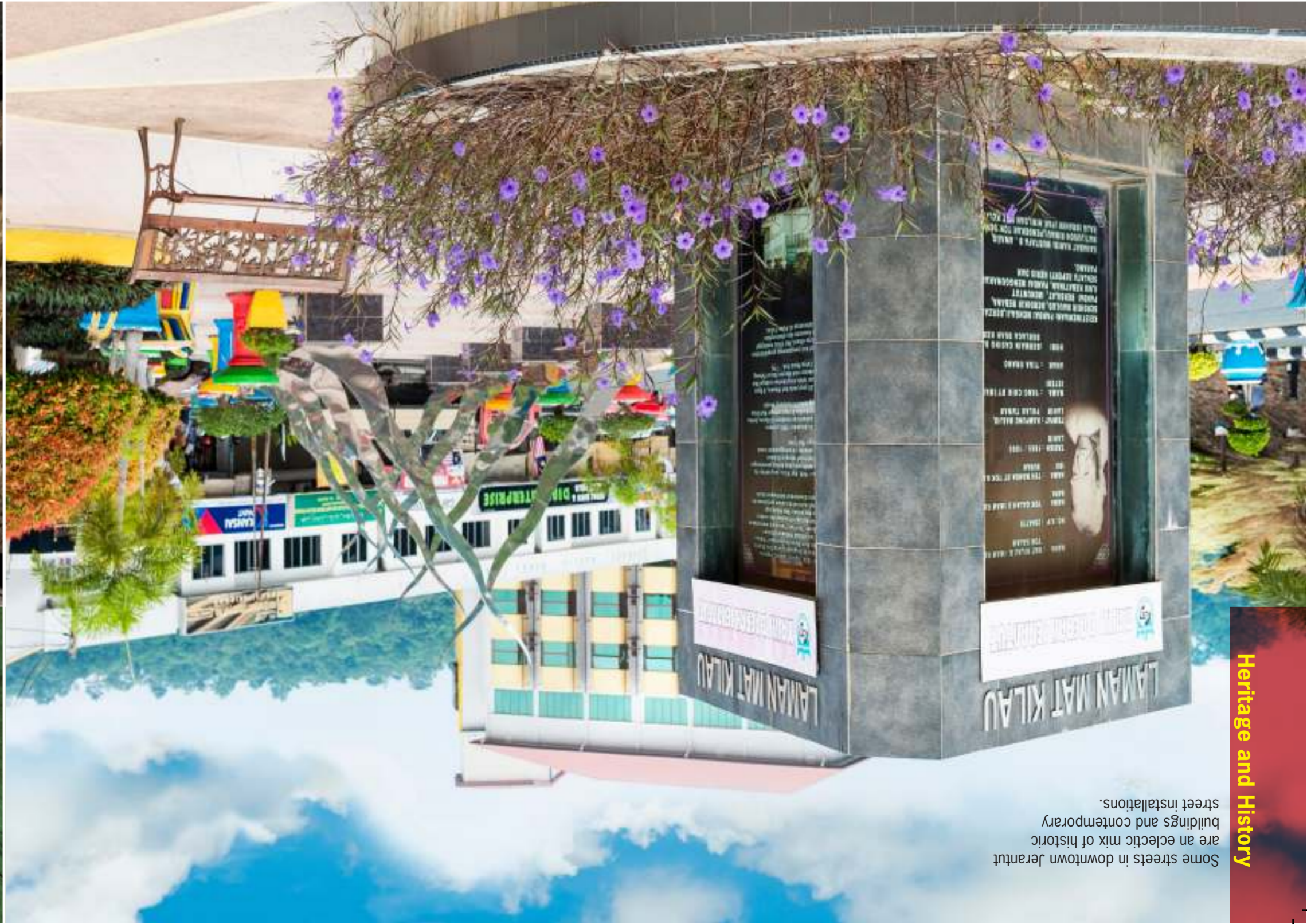
Heritage and History

Some streets in downtown Jerantut are an eclectic mix of historic buildings and contemporary street installations.