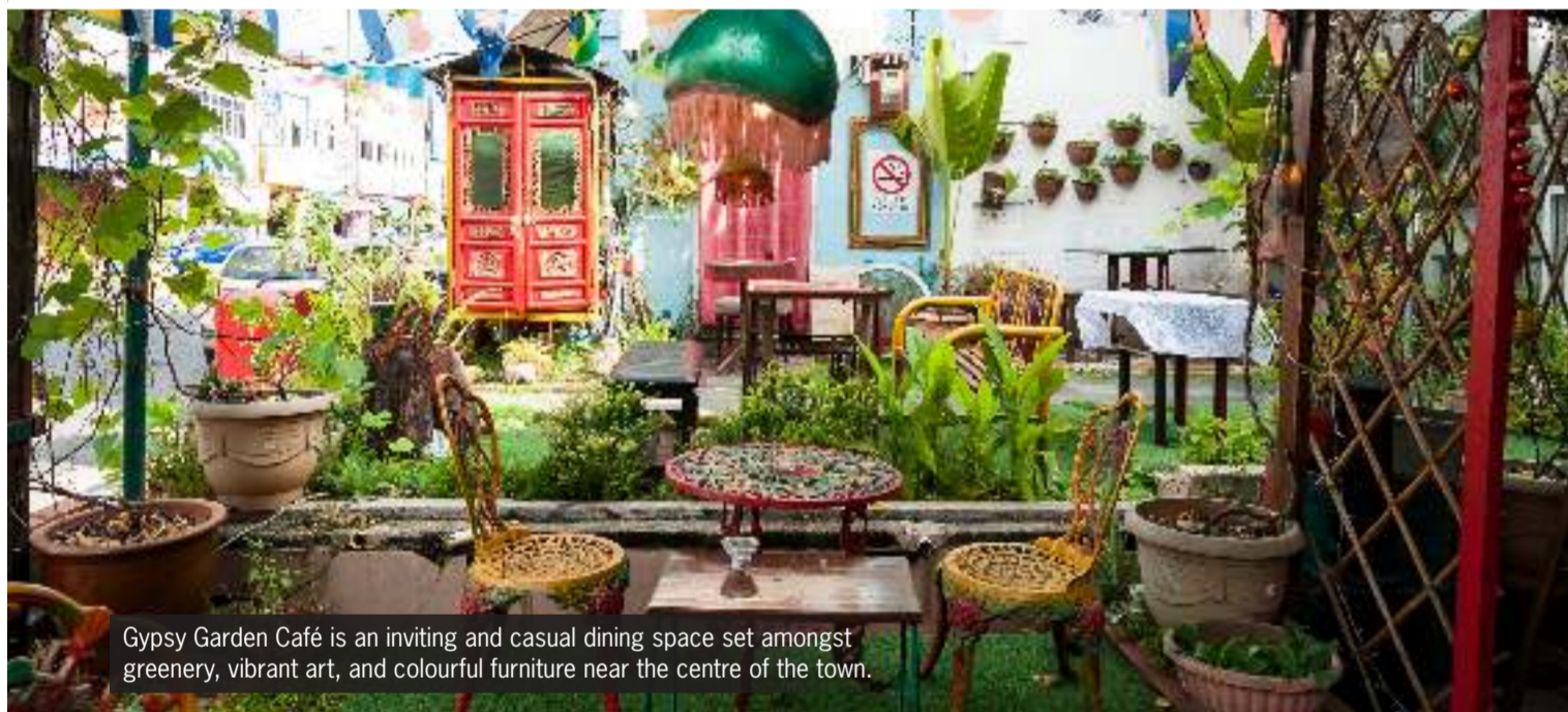
Gypsy Garden Café is an inviting and casual dining space set amongst greenery, vibrant art, and colourful furniture near the centre of the town.