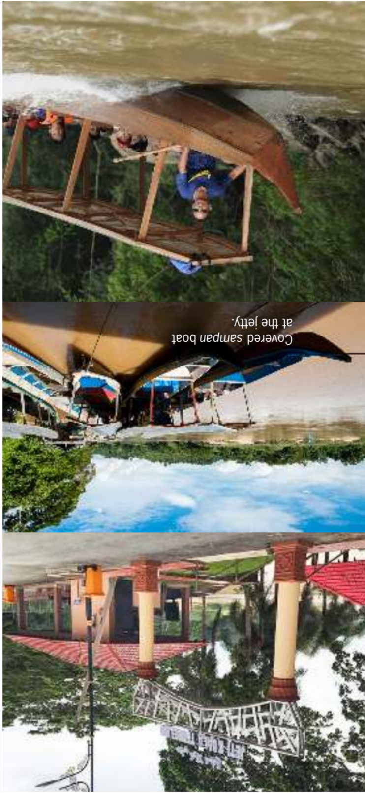
Covered sampan boat at the jetty.

Most adventurers visit Taman Negara on small boats, with the journey up the Pahang River starting from Kuala Tembeling.