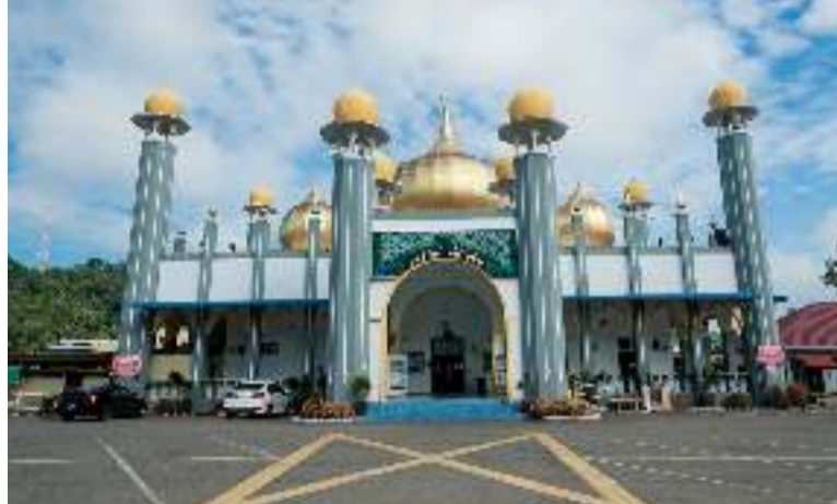
Masjid Tengku Ahmad Jerantut.