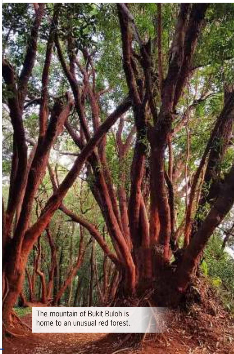
The mountain of Bukit Buloh is home to an unusual red forest.