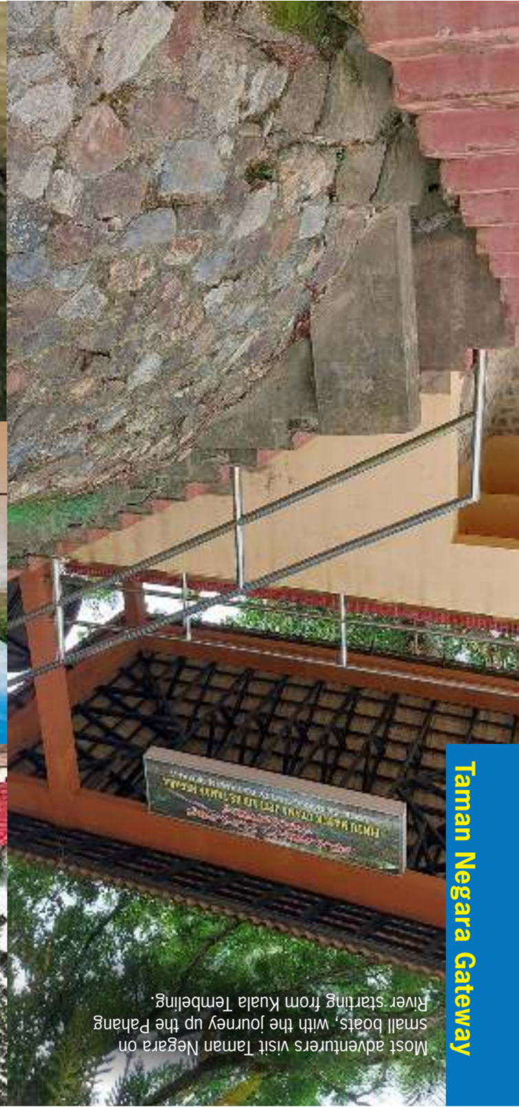
Taman Negara Gateway

Faya Gunung Extreme Park, just out of Jerantut, is home to Peninsular Malaysia's only via ferrata . This climbing network of iron rungs enables rock climbers to ascend the rocky outcrop to enjoy its panoramic views.