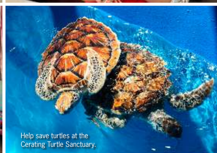
Help save turtles at the Cerating Turtle Sanctuary.