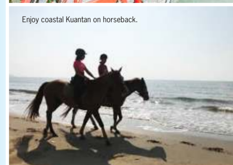
Enjoy coastal Kuantan on horseback.