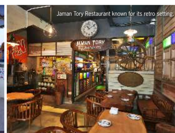
Jaman Tory Restaurant known for its retro setting.