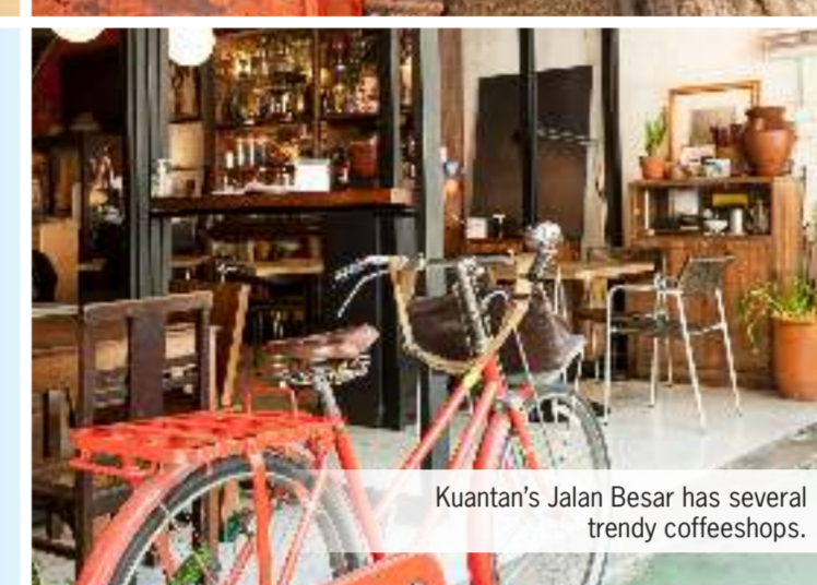
Kuantan's Jalan Besar has several trendy coffeshops.