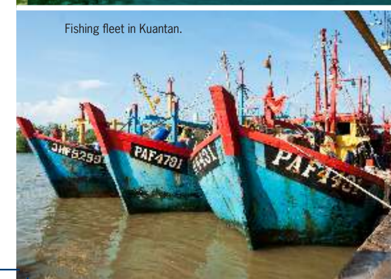
Fishing fleet in Kuantan.