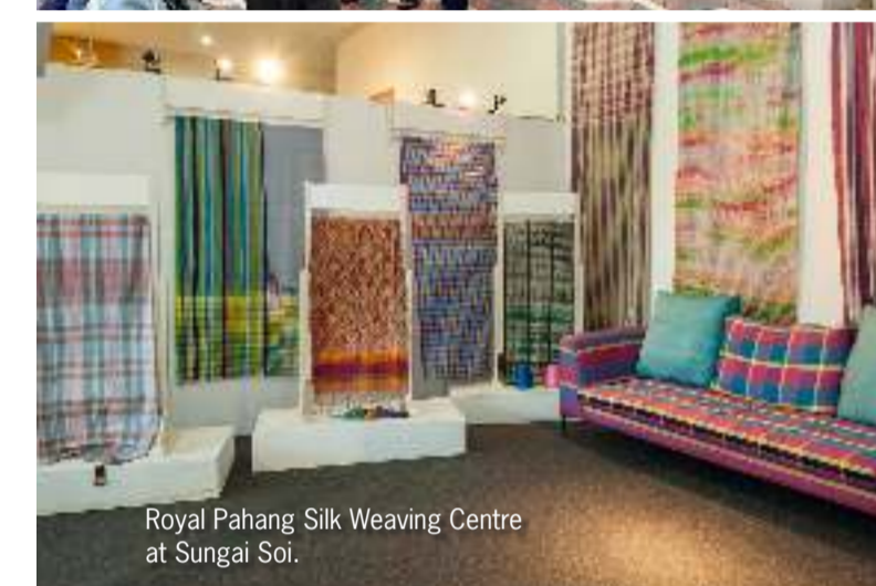
Royal Pahang Silk Weaving Centre at Sungai Soi.