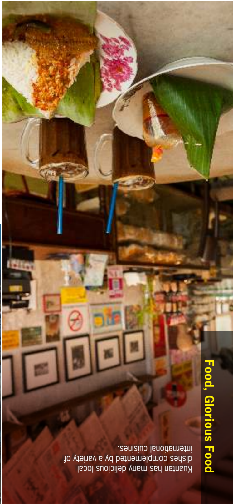
Kuantan has many delicious local dishes complemented by a variety of international cuisines.