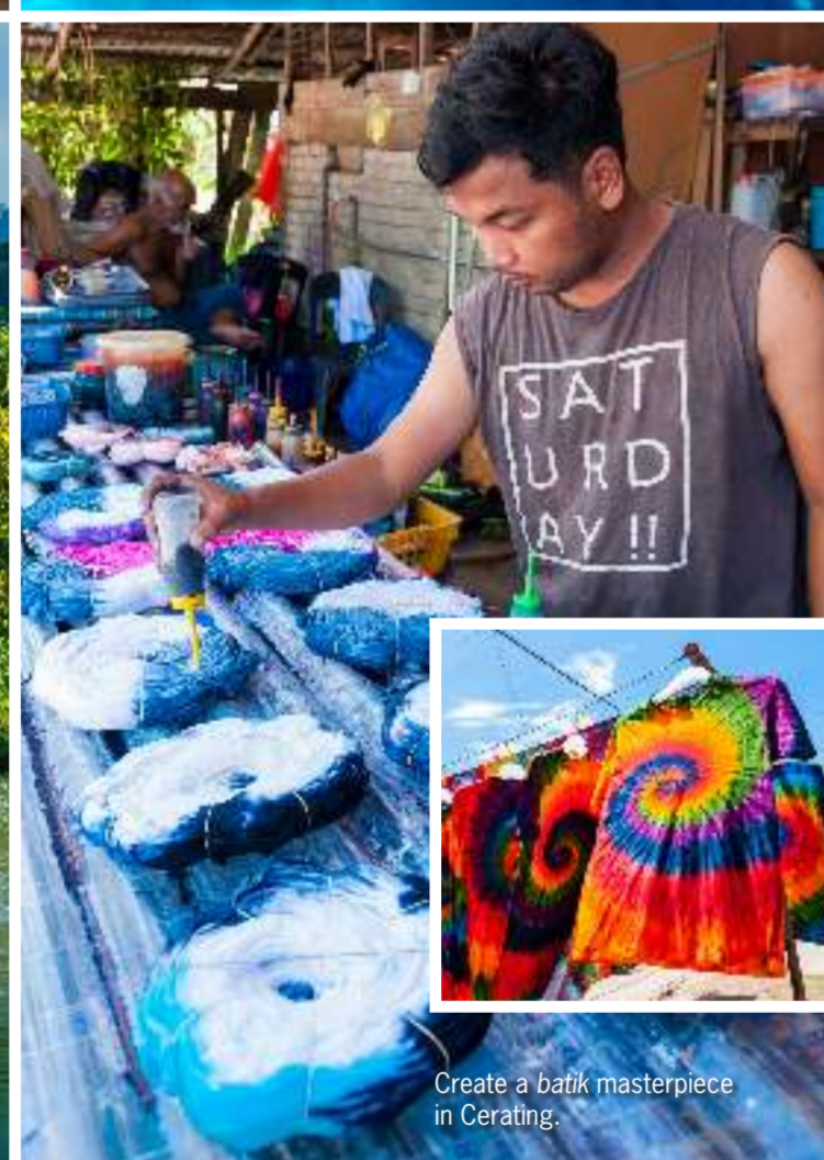
Create a batik masterpiece in Cerating.