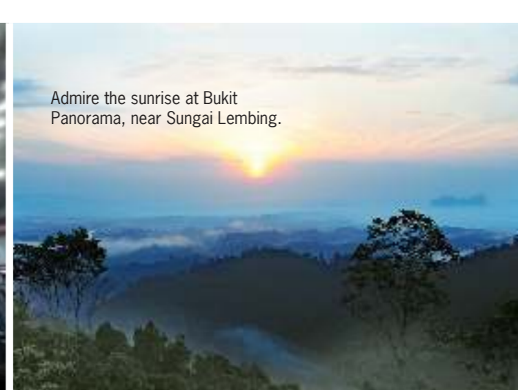
Admire the sunrise at Bukit Panorama, near Sungai Lembing.