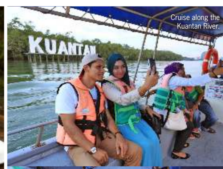
Cruise along the Kuantan River.