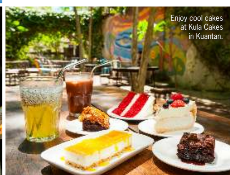
Enjoy cool cakes at Kula Cakes in Kuantan.