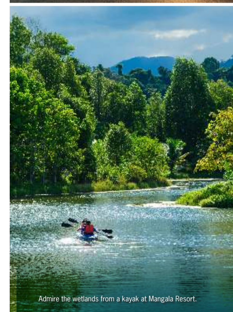
Admire the wetlands from a kayak at Mangala Resort.