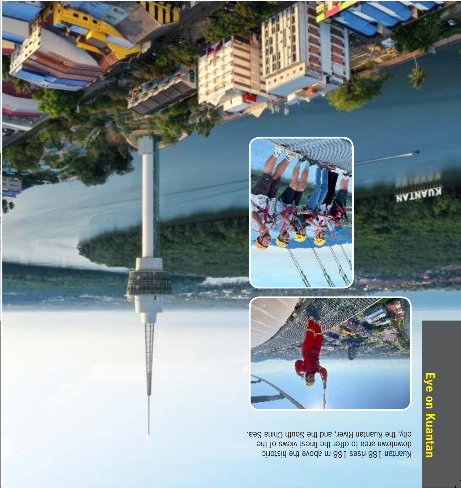
Kuantan 188 rises 188 m above the historic downtown area to offer the finest views of the Kuantan River, and the South China Sea.