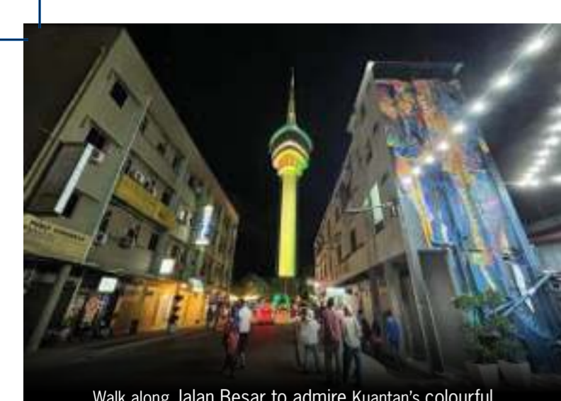
Walk along Jalan Besar to admire Kuantan's colourful heritage and street art.