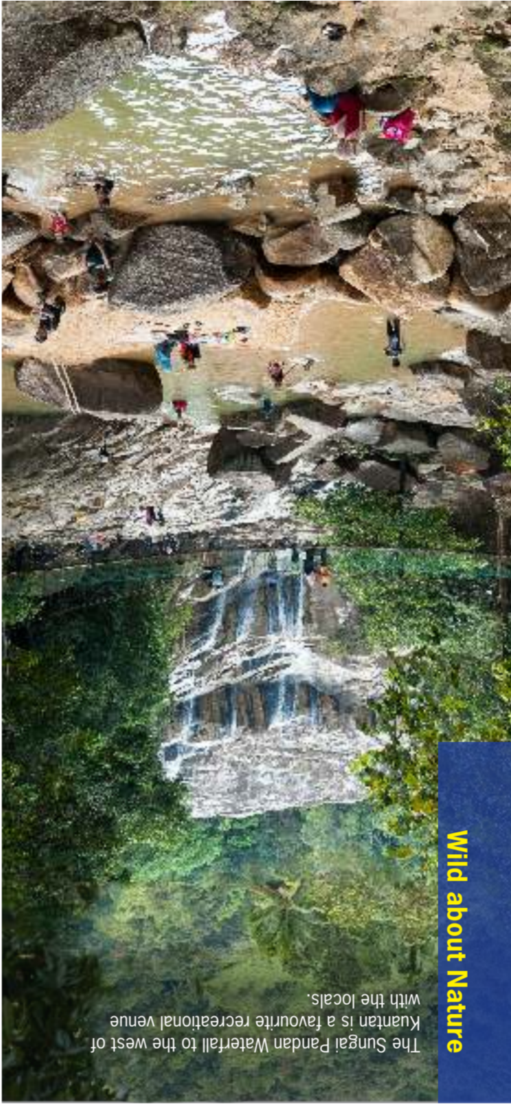
The Sungai Pandan Waterfall to the west of Kuantan is a favourite recreational venue with the locals.