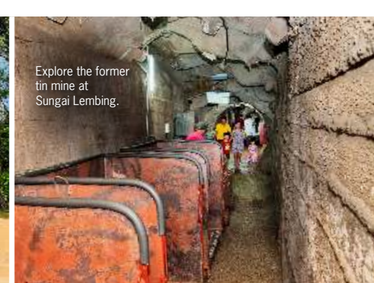
Explore the former tin mine at Sungai Lembing.