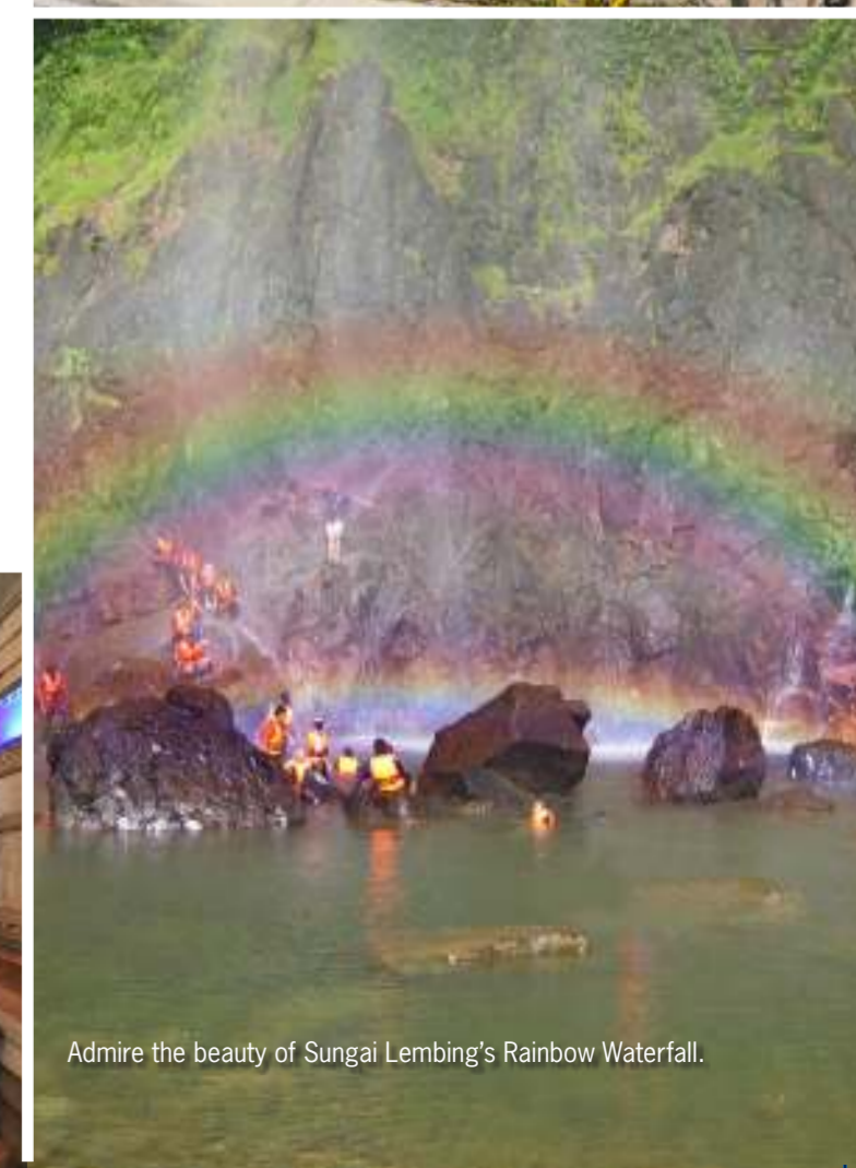
Admire the beauty of Sungai Lembing's Rainbow Waterfall.