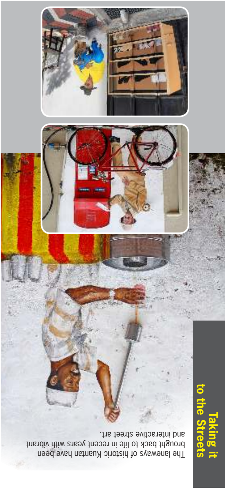
The laneways of historic Kuantan have been brought back to life in recent years with vibrant and interactive street art.