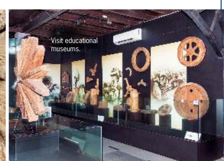
Visit educational museums.