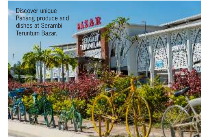
Discover unique Pahang produce and dishes at Serambi Teruntum Bazar.

Sungai Lembing, northwest of Kuantan, was from 1921 to 1941, Malaya's largest tin mine and one of its few underground mines. The streets are a living museum, while its museum is a valuable educational resource. Many people visit Sungai Lembing to enjoy dishes like mee Jawa , bak kut teh and steamboat, stay in small hotels and visit the weekend market. An interactive tin mining display is located at the site of the former mine shaft. Panorama Hill with its rainbow waterfall is popular among photographers; while nearby Charas Cave and Sungai Pandan Waterfall also appeal.