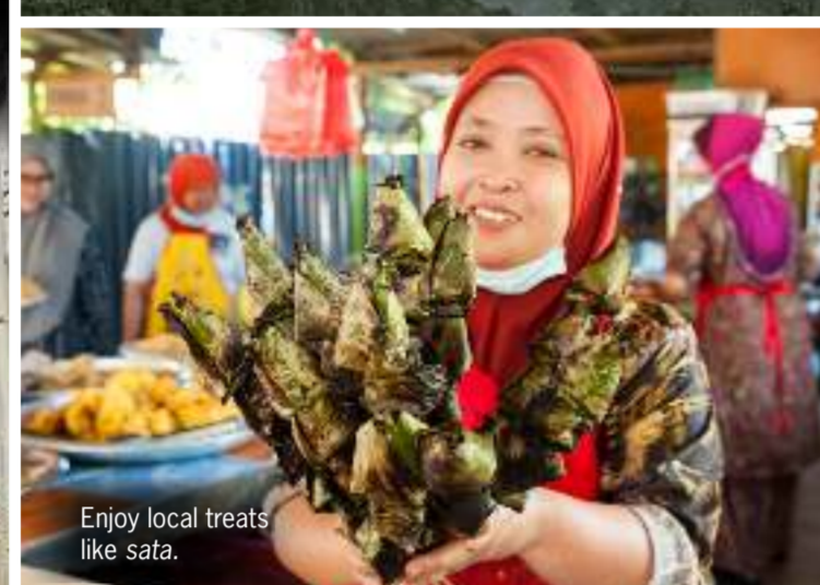
Enjoy local treats like sata.