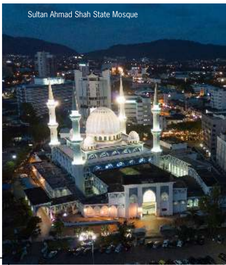
Sultan Ahmad Shah State Mosque