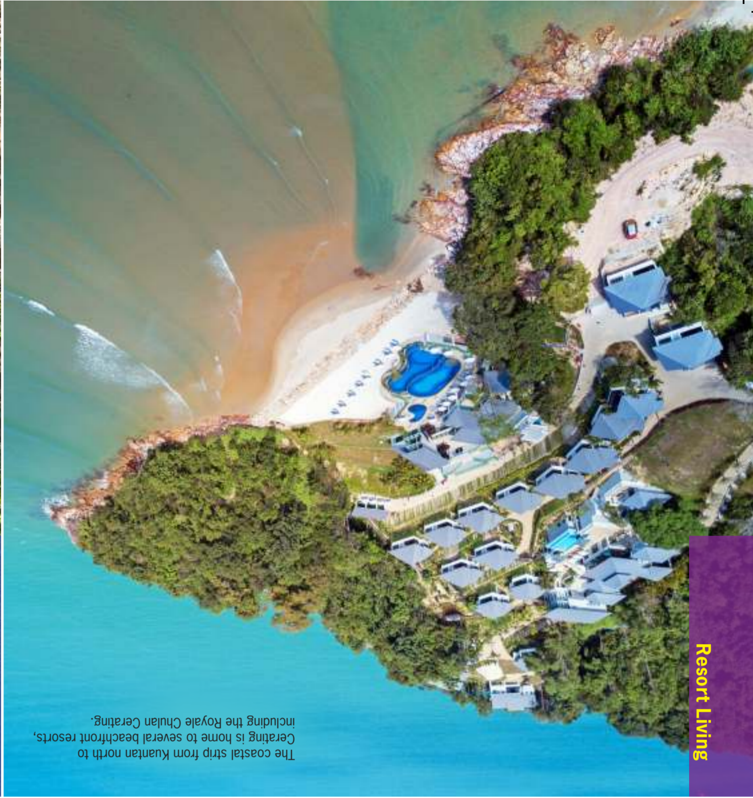
The coastal strip from Kuantan north to Cerating is home to several beachfront resorts, including the Royale Chulan Cerating.