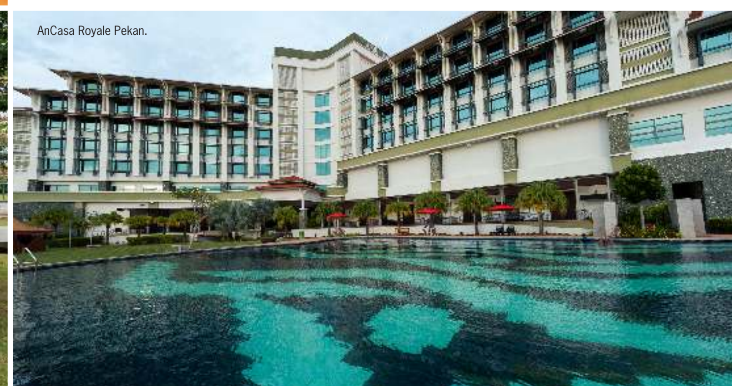
AnCasa Royale Pekan.