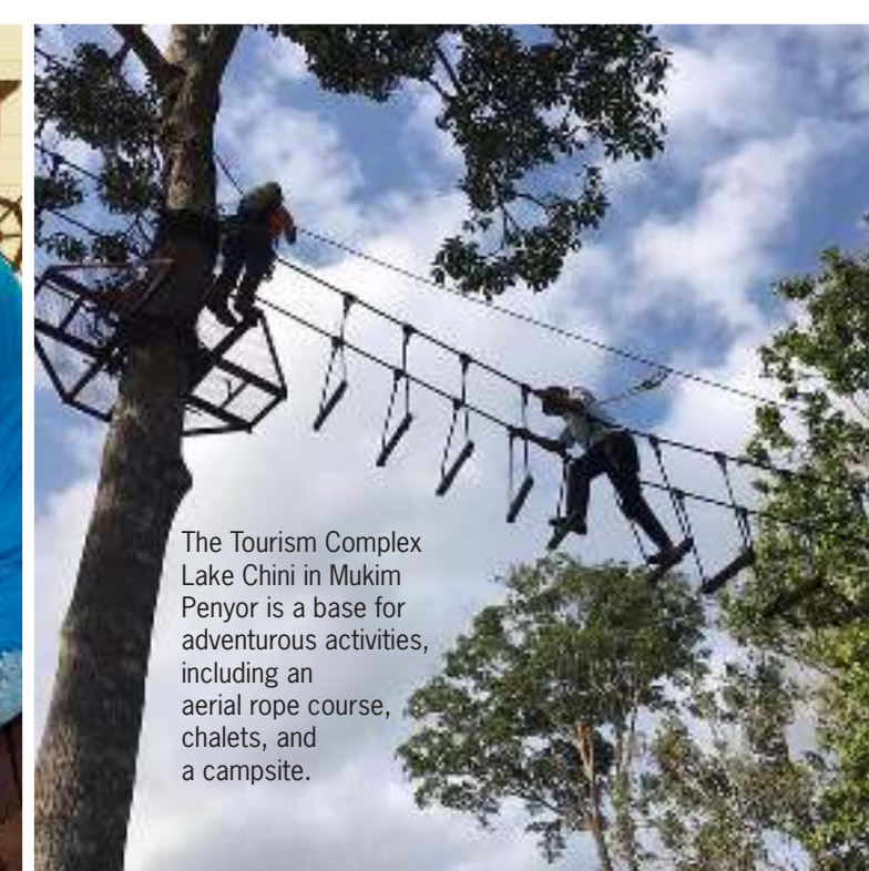
The Tourism Complex Lake Chini in Mukim Penyor is a base for adventurous activities, including an aerial rope course, chalets, and a campsite.