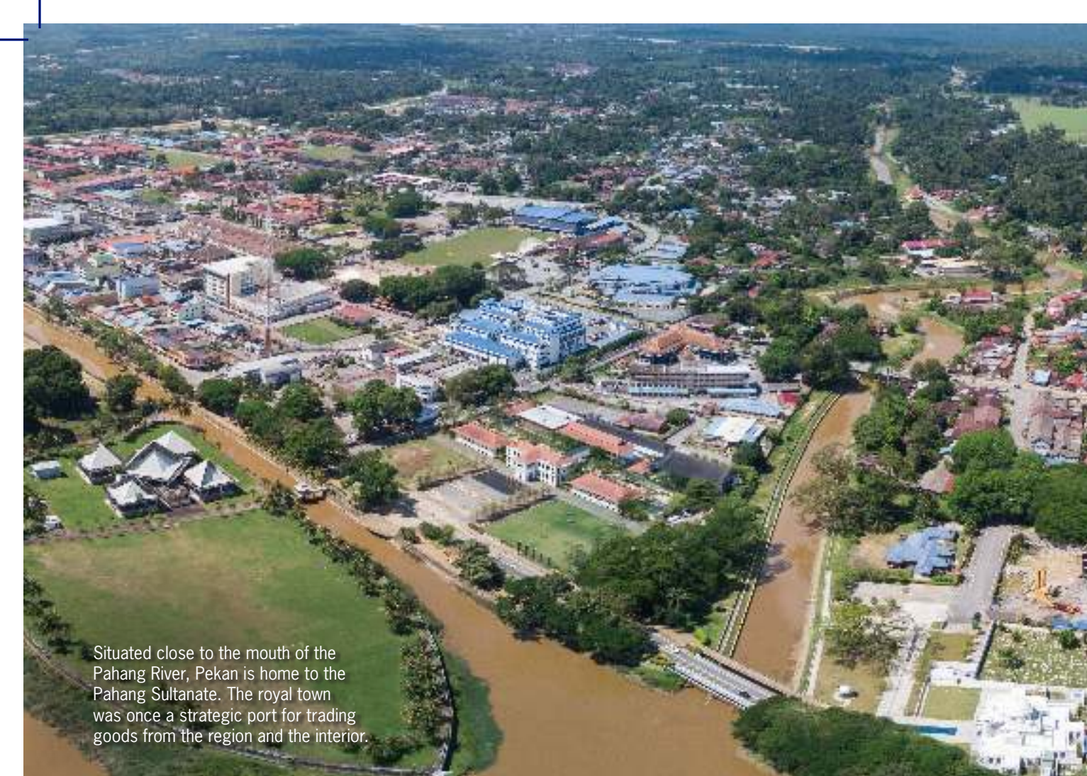
Situated close to the mouth of the Pahang River, Pekan is home to the Pahang Sultanate. The royal town was once a strategic port for trading goods from the region and the interior.