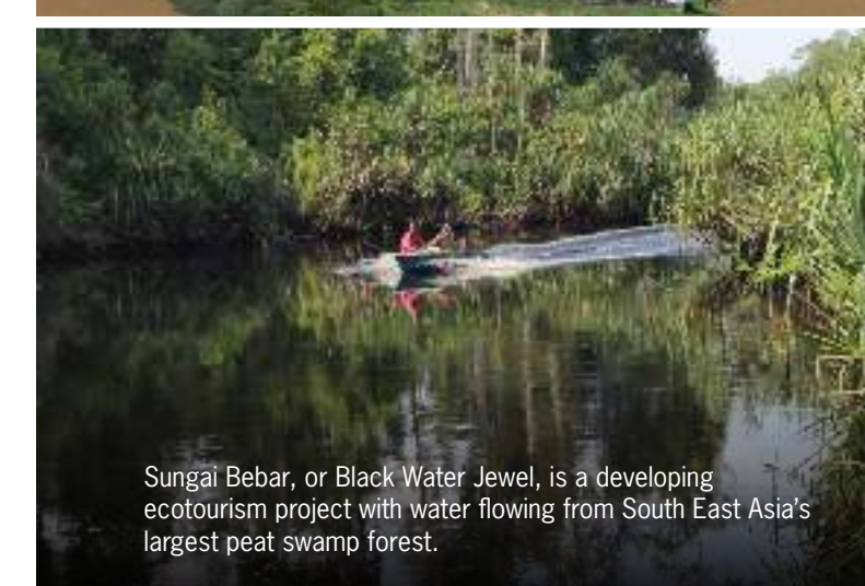
Sungai Bebar, or Black Water Jewel, is a developing ecotourism project with water flowing from South East Asia's largest peat swamp forest.