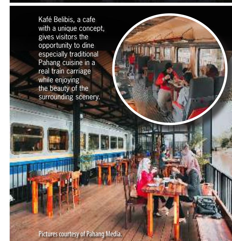
Kafé Belibis, a cafe with a unique concept, gives visitors the opportunity to dine especially traditional Pahang cuisine in a real train carriage while enjoying the beauty of the surrounding scenery.