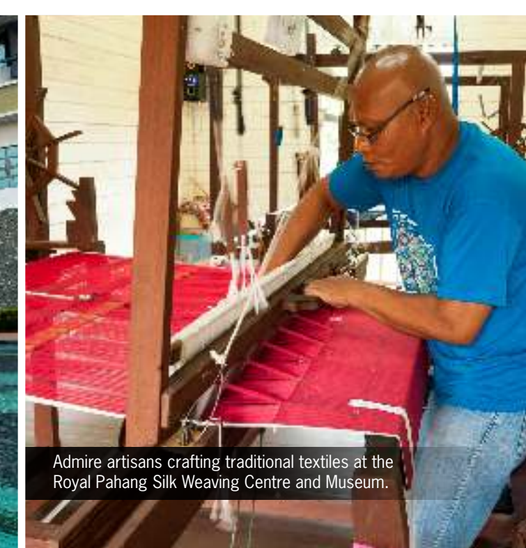
Admire artisans crafting traditional textiles at the Royal Pahang Silk Weaving Centre and Museum.