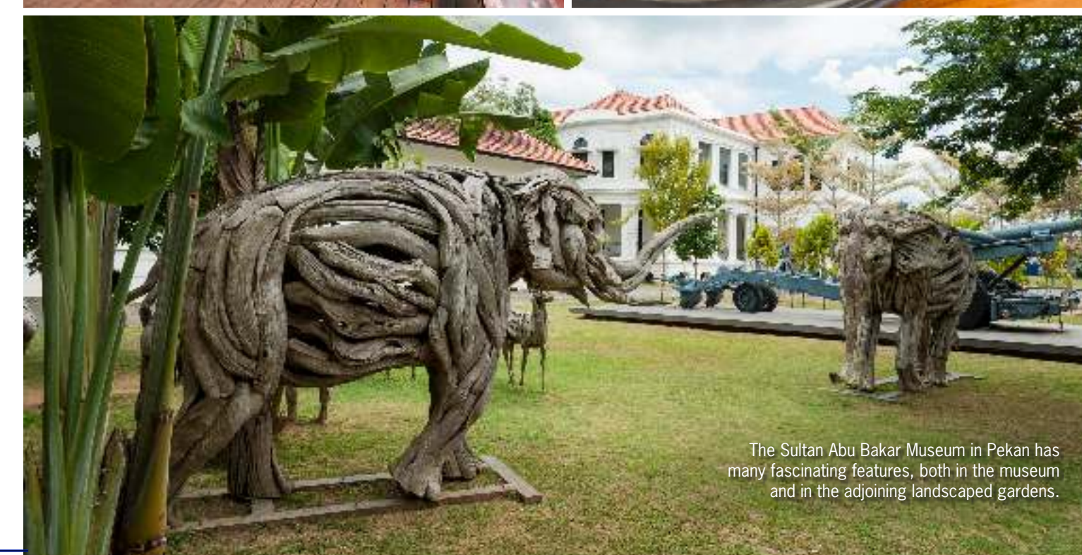
The Sultan Abu Bakar Museum in Pekan has many fascinating features, both in the museum and in the adjoining landscaped gardens.

Pekan is located 46 km south of Kuantan, 276 km from Kuala Lumpur and 296 km from Singapore. Tasik Chini is located 50 km west of Pekan.