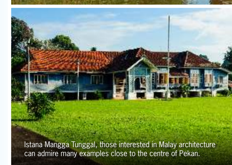
Istana Mangga Tunggal, those interested in Malay architecture can admire many examples close to the centre of Pekan.