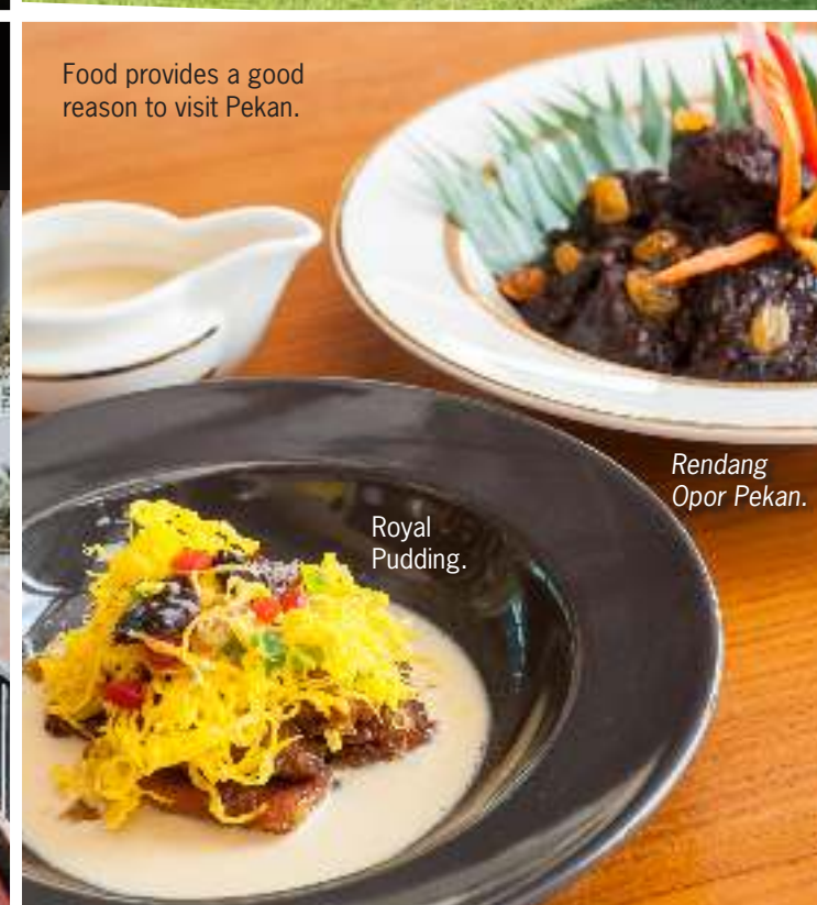
Food provides a good reason to visit Pekan.