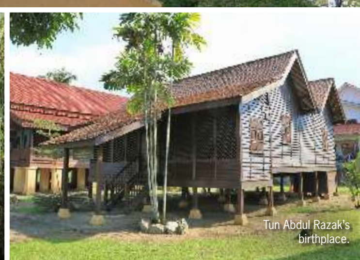
Tun Abdul Razak's birthplace.