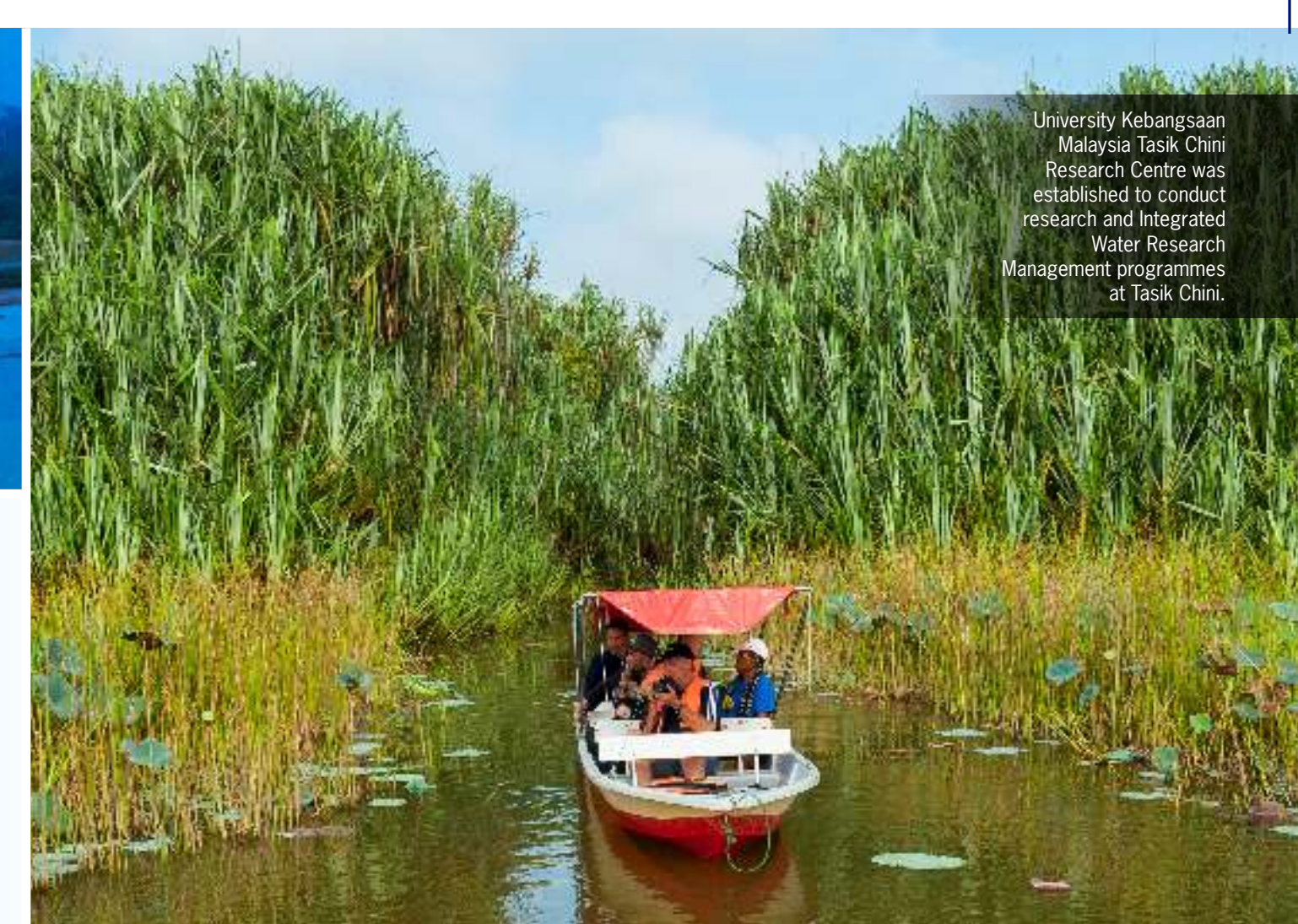
University Kebangsaan Malaysia Tasik Chini Research Centre was established to conduct research and Integrated Water Research Management programmes at Tasik Chini.